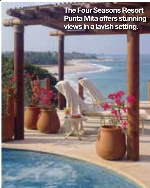
The Four Seasons Resort Punta Mita offers stunning views in a lavish setting.