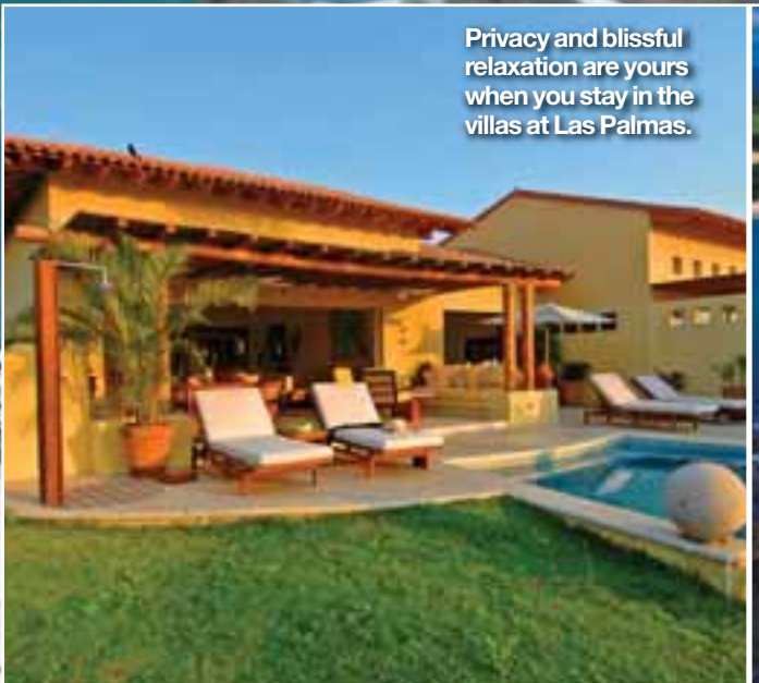
Privacy and blissful relaxation are yours when you stay in the villas at Las Palmas.