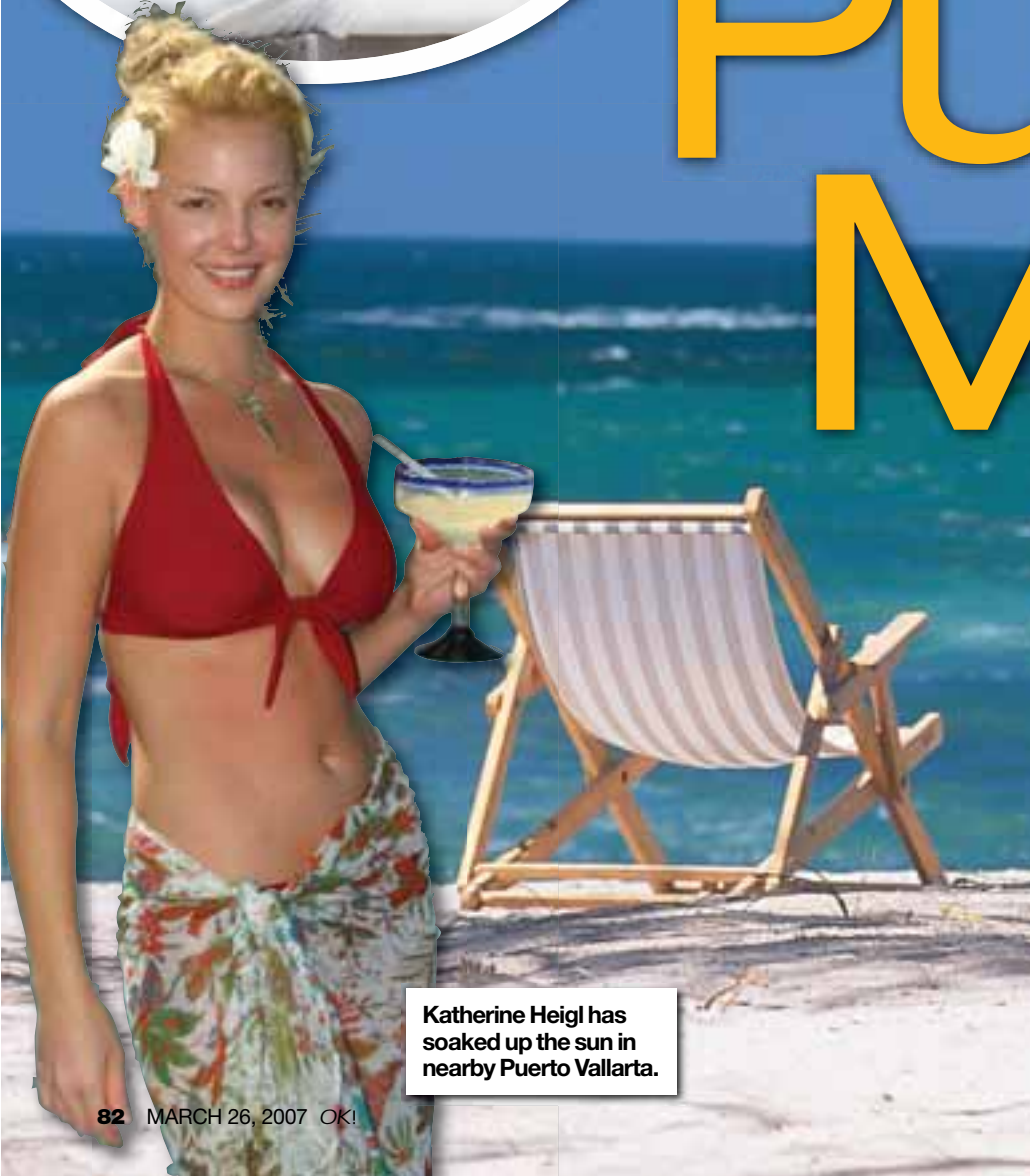
Katherine Heigl has soaked up the sun in nearby Puerto Vallarta.