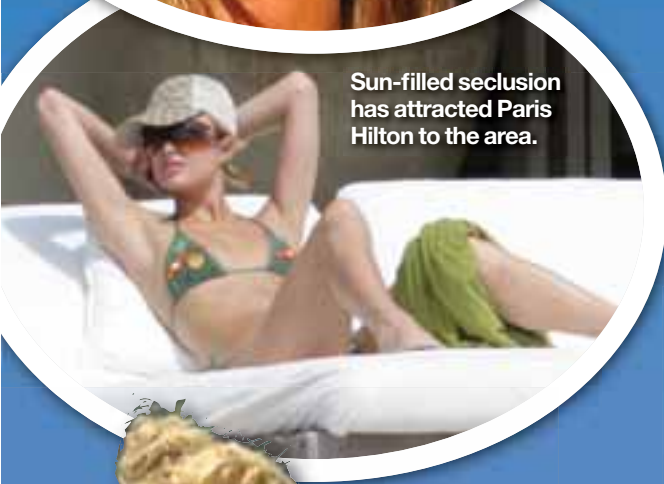
Sun-filled seclusion has attracted Paris Hilton to the area.

Miles from the nearest big city, this vibrant Mexican peninsula is perfect for a sublime siesta